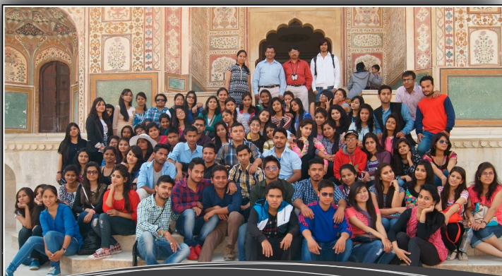
Educational tour of B.Sc. Biotechnology students to Jaipur